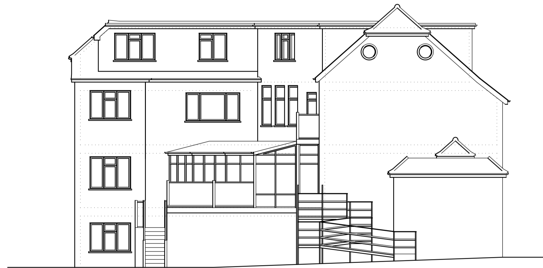
rear elevation scale 1:100