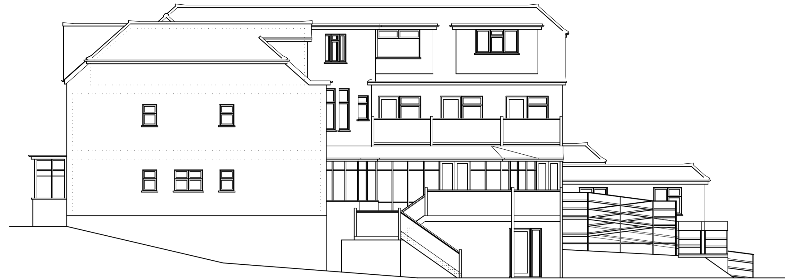
side elevation scale 1:100