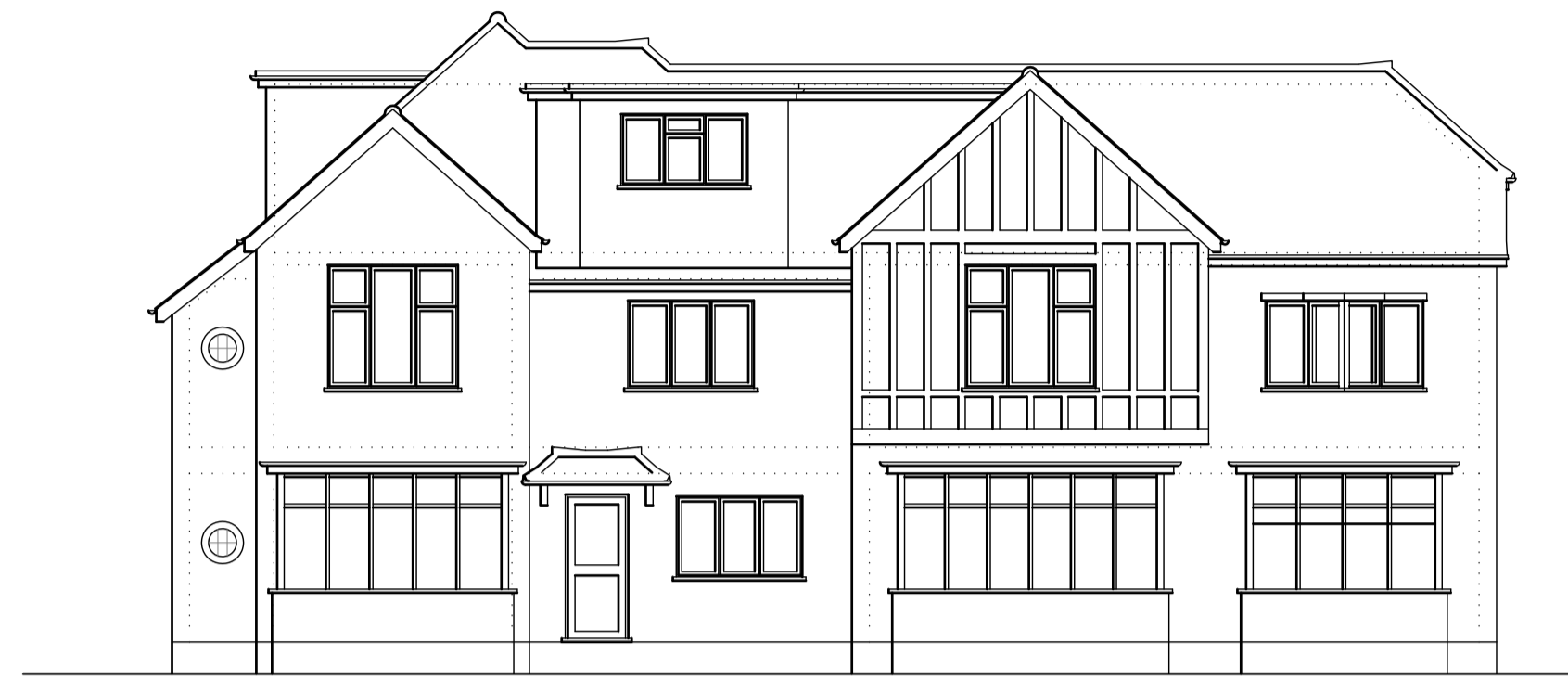
front elevation scale 1:100